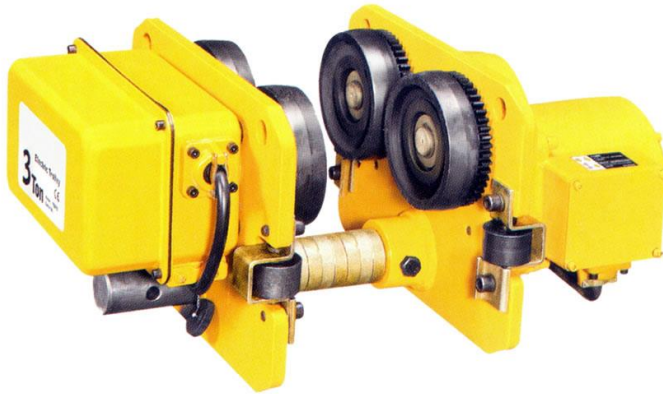
Capacity: 0.5-10 Ton

Specially recommended for loads over 500 kg, for transporting over long distances and/or when used frequently. Suitable for almost all hoists with coupling rings.